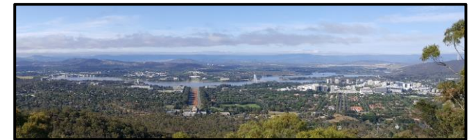
CAL, October 2023